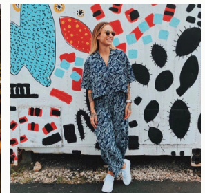
Provide space for local artists and talents.