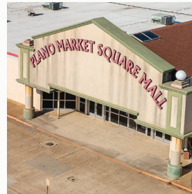
Update existing structure to a modern design.