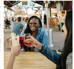
Develop a new culinary destination.