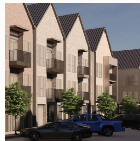
Build a modern on-site living community.