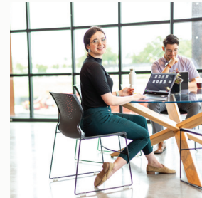
Provide fresh space for collaboration and creation.