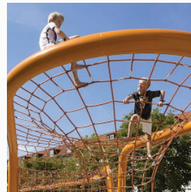
Create a family-friendly park-like environment.