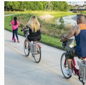
Connect to community with hike and bike trails.