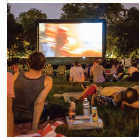
Heighten and develop community culture.